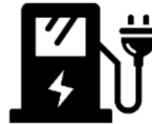
Zero Emission Vehicles Infrastructure