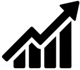
Business Investment Services