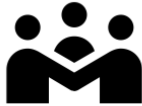
Community & Place Based Solutions