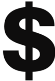
Infrastructure and Economic Development Bank (I- Bank)